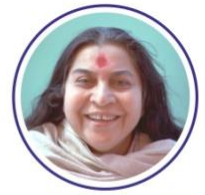
Her Holiness Mataji Shree Nirmala Devi (Founder of Sahaja Yoga)

(Formed as per instructions given on July 20, 2008 by Mataji Shree Nirmala Devi, after Guru Puja)