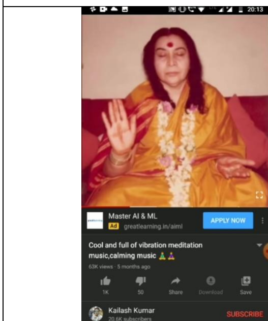
Cool and full of vibrations meditation music - without advertisement