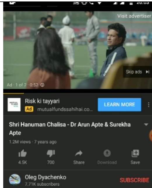
Shree Hanuman Chalisa- with Advertisement