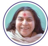
Her Holiness Mataji Shree Nirmala Devi (Founder of Sahaja Yoga)

(Formed as per instructions given on July 20, 2008 by Mataji Shree Nirmala Devi, after Guru Puja)